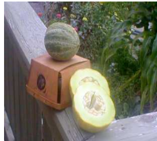
Anne Arundel melon, pre-1756

The popularity of hybrids over heirlooms only began post-World War II. The main reason for hybrids' rise in popularity is due to hybrids' better shelf life, allowing them to be shipped from far away and retain their appearance. Unless you plan to ship your homegrown vegetables out of state this is not really a concern for the home gardener. So go on, give heirlooms a try! You'll fall in love!