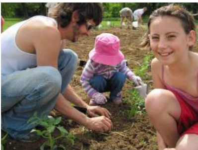
Planting day in the heirloom vegetable patch.

On a sunny Saturday morning in May the Heirloom Vegetable Patch Project got underway at the Horn Farm. Gardeners of all ages met on May 15 for a workshop on planting tips and heirloom vegetables and then carried their flats of plants and packets of seeds to their assigned patches to begin planting. All 18 patches are thriving – come check out the colorful basil, tomato and pepper varieties, yellow squash, zucchini and beans!