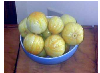
Lemon Cucumber, 1890