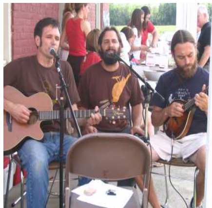
Bluegrass trio, "The Cultivators," entertaining Farmstand tourists at the Horn Farm.

August 8, 2009 was off to a good start! There were 15 farmstands to visit all over York County, the weather was sunny and breezy and over 200 people turned out for the tour. From 10 am to 3 pm the public discovered farmstands from Delta, Stewart-