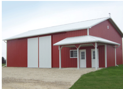
Proposed 50' x 60' pole barn

The Horn Farm Center is excited to announce plans to build a pole barn this winter. The 3,000 square foot structure will measure 50' x 60', and will be situated just to the north of the existing corn barn. Having lost the old bank barn to fire, we need a practical