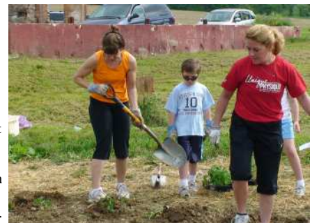
Family eagerly planting vegetables on their assigned plot.

Cut zucchini diagonally into paper-thin slices with slicer. Arrange slices, overlapping slightly, in one layer on 4 plates. Make stacks of mint leaves and cut crosswise into very thin sliver, then sprinkle over zucchini. Whisk together oil and lemon juice in a small bowl, then drizzle over zucchini. Sprinkle with sea salt, pepper to taste and pine nuts. Let stand 10 mins. to soften zucchini and allow flavors to develop. Just before serving, use a vegetable peeler to shave cheese to taste over zucchini, then sprinkle with zucchini blossoms and mint.