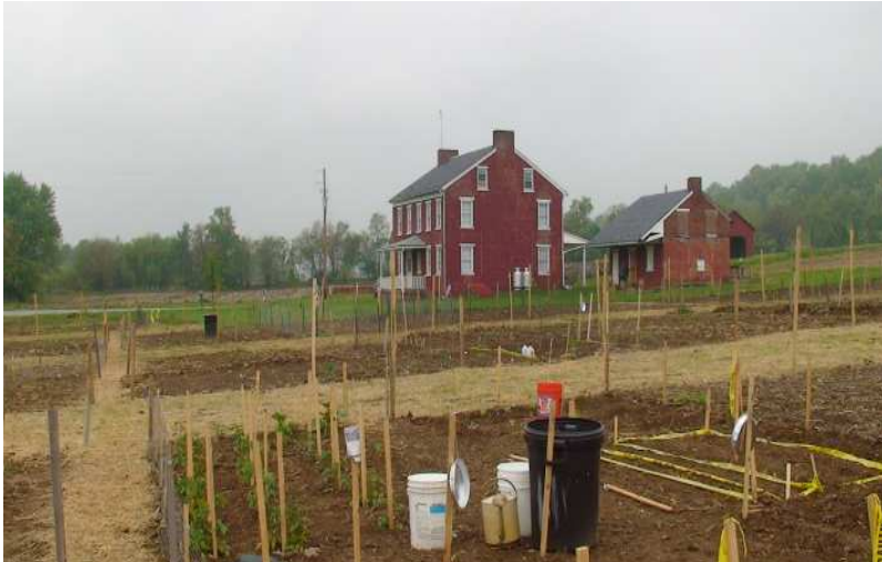
Here are plots staked out in the spring with Horn Farm buildings in the background.

the plots opened, 47 gardeners had signed up, and all the plots are rented for the season.